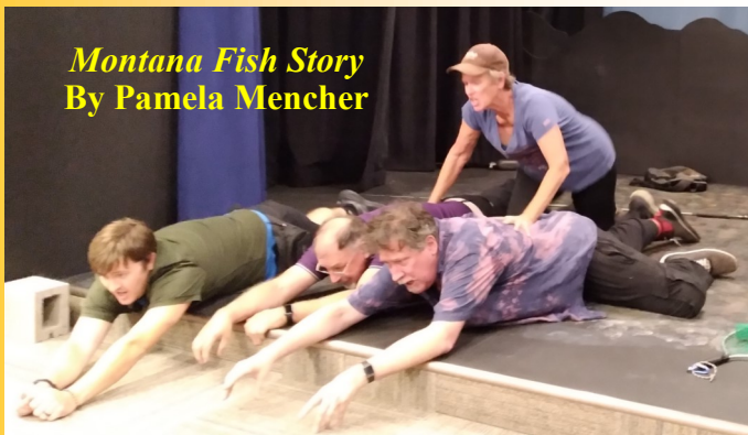
Montana Fish Story By Pamela Mencher