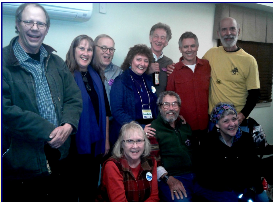
Former RMTA Members and Presenters: